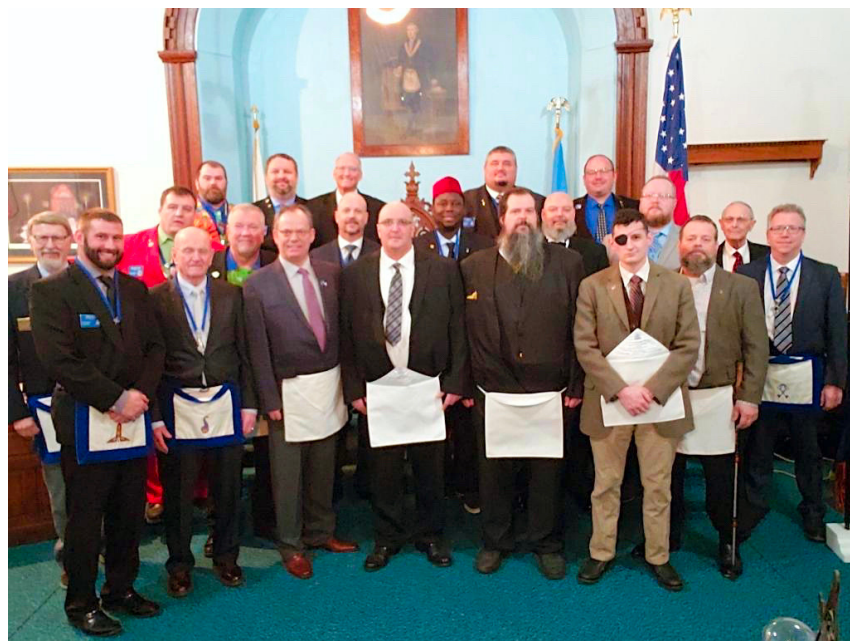
Our newest Entered Apprentices at our recent EA Degree