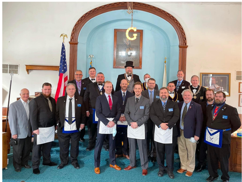
Our newest Master Masons during our joint degree with Newport Lodge