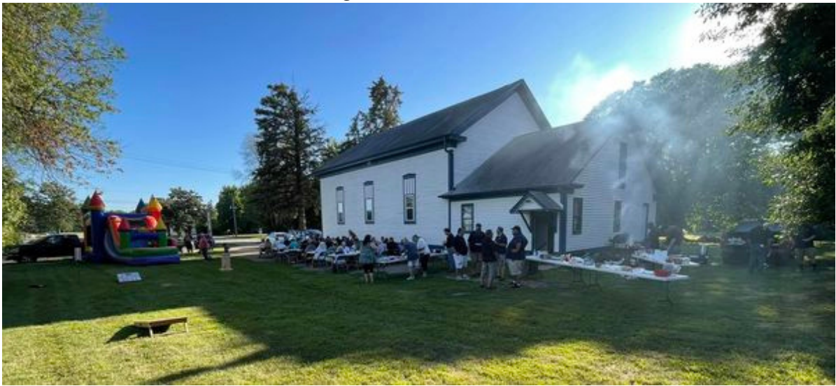
Accacia's annual family and friends picnic was a huge success!