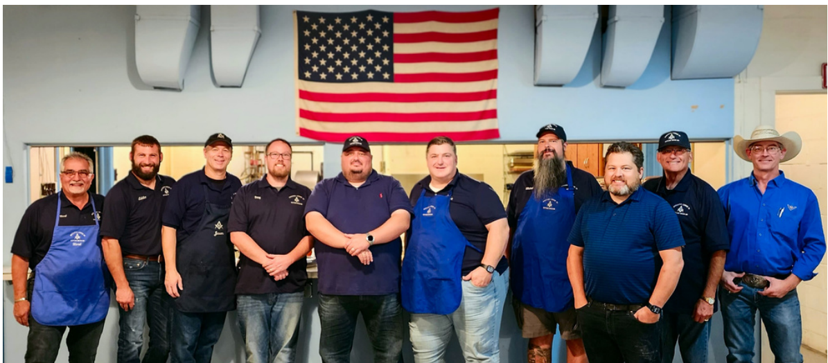
Accacia's annual spaghetti dinner and raffle was very successful!