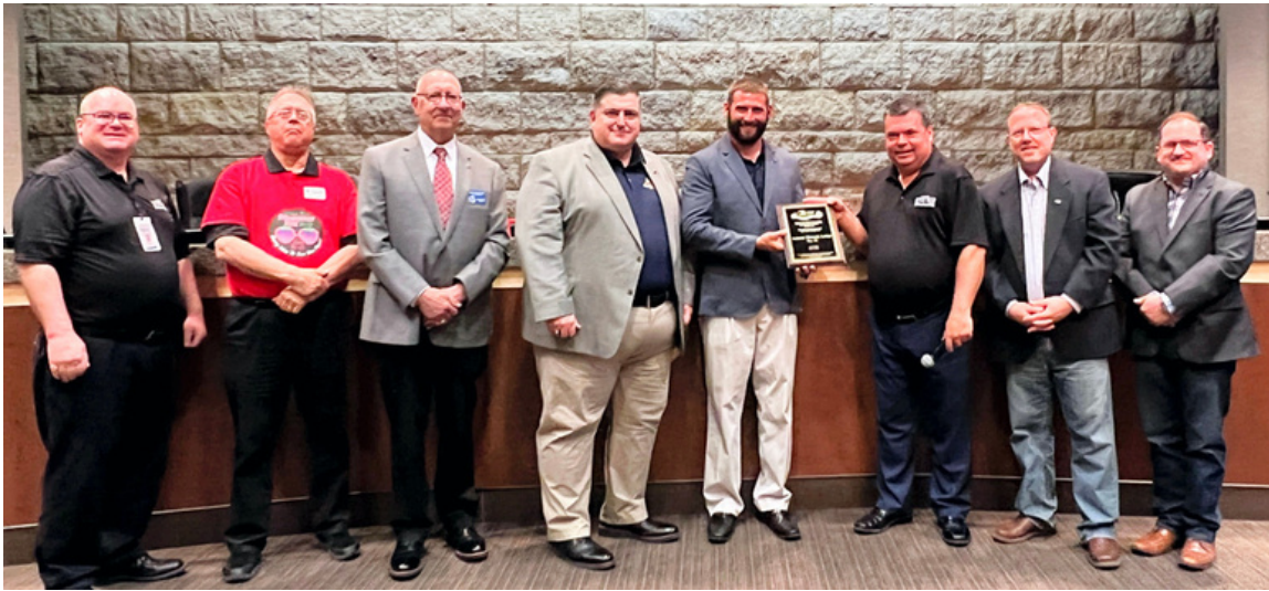
Accacia No. 51 received Cottage Grove Perservationist of the Year Award