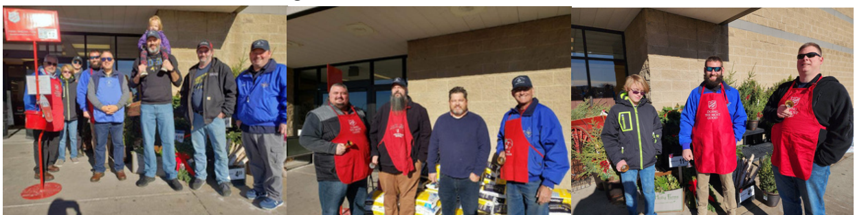
Many Accacia Brothers helped with bell ringing for the Salvation Army